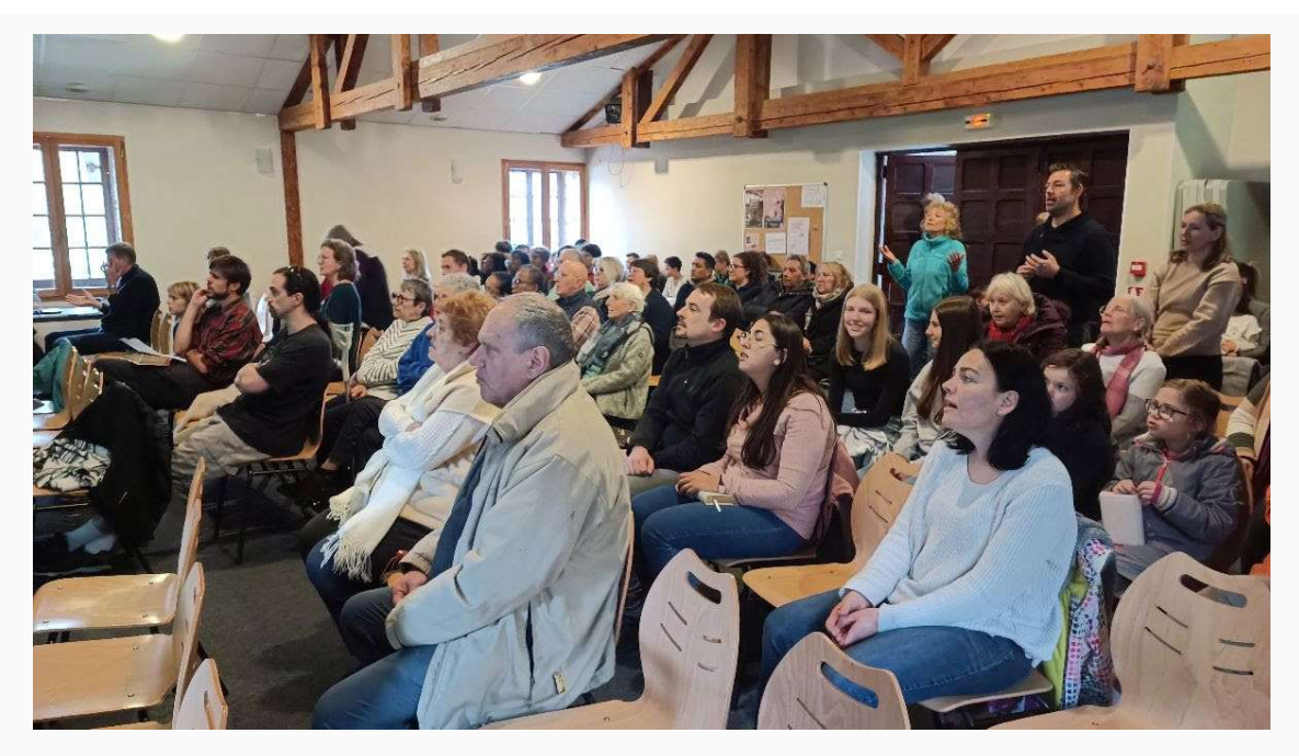
The church worshipping during the week-end away.