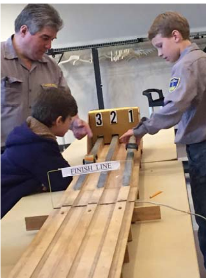
Cadets race their Derby cars.

Did you know? We offer Cadets and Gems starting in First Grade! We have been blessed with continued partnership with Fifth Reformed Church and look forward to many more faith-filled Wednesday nights in the neighborhood.