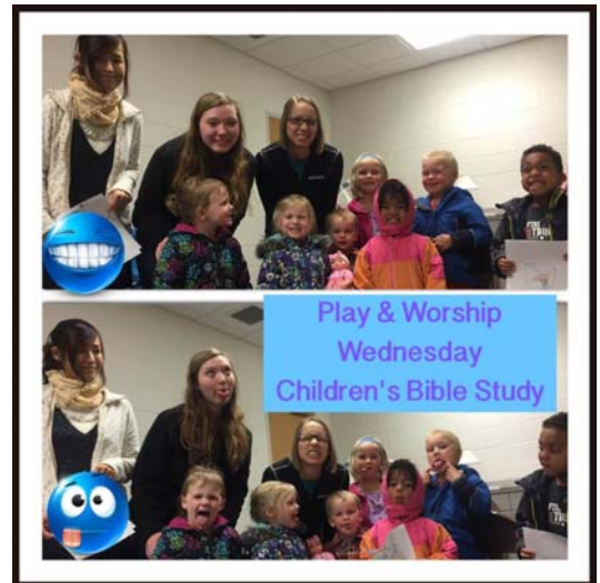
Children's Bible Study's last night for the season.