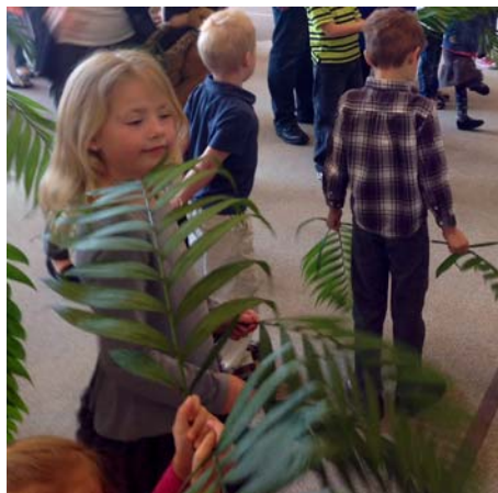
Plymouth's youngest on Palm Sunday.

Join council in welcoming these servants of the Lord to Plymouth, and join us in praising God for His leading hand in this process!